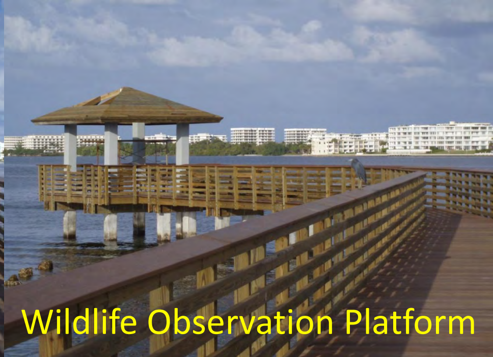
Wildlife Observation Platform