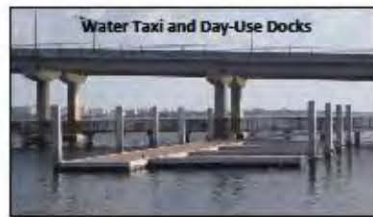
Water Taxi and Day-Use Docks