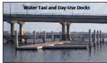
Water Taxi and Day-Use Docks