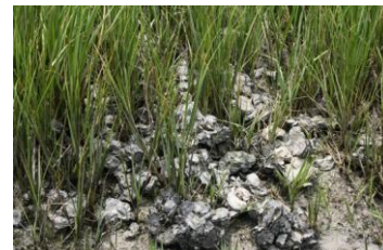
Oysters and Spartina (cordgrass)

As of early March, Palm Beach County has received all environmental permits necessary for the Snook Islands Phase II and Bryant Park Wetlands projects. Currently staff is working on plans and specifications for both projects and once finalized, the jobs will be bid out together. The projects will expand mangrove, oyster and seagrass habitat south of the Lake Worth Bridge. Construction is anticipated to begin in early 2012. A majority of the funds for both projects, estimated at 5-6 million dollars will come from outside agencies. To learn more, read the project fact sheet (PDF) .