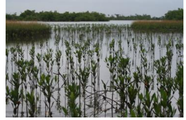
The proposed project is similar to the Ibis Isle Restoration Project.

Palm Beach County ERM is proposing a 15-acre project in Lake Worth Lagoon, south of Ibis Isle and adjacent to the Town of Palm Beach's Par 3 Golf Course. Similar to the Ibis Isle Restoration Project, sand will be placed on top of existing muck sediments to create seagrass, mangrove, cordgrass, and oyster habitat. The project will provide vital habitat for fisheries, wading birds and shorebirds, manatees, and sea turtles. Potential funding sources include State and Federal grants.