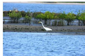
Snook Islands Natural Area

The project is currently underway with the contractor coordinating work with local utility departments to mark underwater cables in the area. Once these are fully marked, the first element of the project will be the demolition of the remnant west portion of the old Lake Worth bridge. The concrete rubble from the demolition will be used to create an artificial reef. Work is expected to be completed by the end of 2011. To learn more, read the project fact sheet (PDF) .