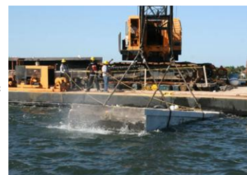
Everglades Island Artificial Reef

The Everglades Island Inshore Artificial Reef Project is nearly complete. The project contractor placed approximately 1,000 tons of clean concrete bridge pieces to build the reef. The project was funded by the Florida Department of Transportation. Palm Beach County ERM staff expect the reef ledges and overhangs will be attractive to a variety of fish including snappers, goliath groupers and snook. To learn more, read the project fact sheet (PDF) .