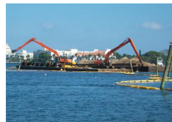
South Cove Natural Area

To date over 110,000 cubic yards of sand has been transported to South Cove. The County anticipates receiving additional material over the next couple months from two local dredging projects. The Department has issued the Invitation for Bid for construction of the remaining components of the project (the mangrove islands and planters, oyster reef, and boardwalk) with construction anticipated to begin in July. To learn more, read the South Cove Natural Area Eco-Treasures Poster (PDF) .